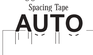
Coroplast Negative Cut Template

A variety of mounting guides are available for a quick and easy installation.