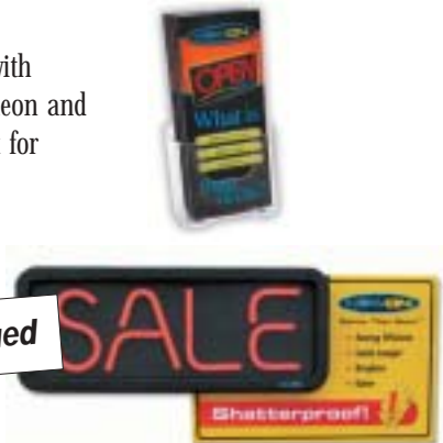
Introductory Package 3