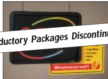
Introductory Package 2