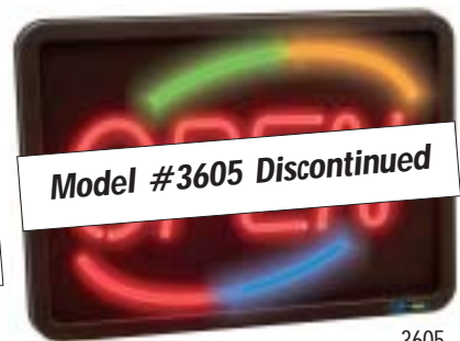
3605 OPEN 6" Letters with 4 Color Ellipse 17"h x 24"w