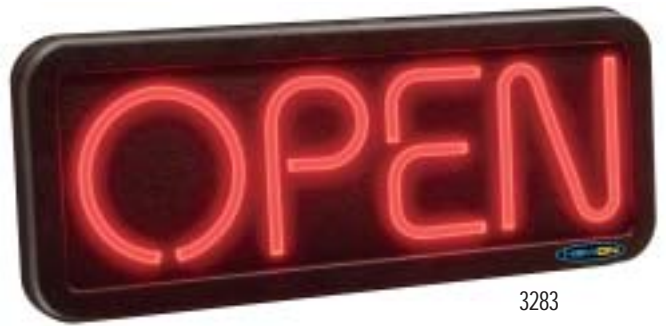
3283 OEPN 6" Letters - 10-1/2"h x 25-1/2"w

For the brilliance of neon without the fragile glass and hazardous gases we offer NEWON. This revolutionary technology uses light emitting diodes (LED's) to create a lightweight, shatterproof, longer lasting and more energy efficient sign. NEWON signs get attention! Display one in your storefront as an open sign to start generating sales right away. All NEWON signs shown below are a slim 1-1/2" deep.