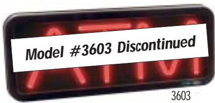
3603 ATM 6" Letters - 10-1/2"h x 25-1/2"w