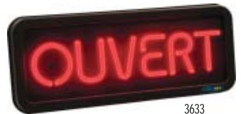
3633 OUVERT 4-1/2" Letters - 10-1/2"h x 25-1/2"w

Storefront packages include a Point of Purchase display and promotional brochures with holder. Your POP display and product literature features the benefits of NEWON over neon and are ready to be personalized with your shop information.. NEWON brochures are great for counter top display or to distribute to your customers and community.