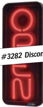
3282 OPEN 5" Letters 25-1/2"h x 10-1/2"w