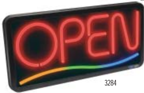
3284 OPEN 8" Letters with 3 Color Wave 14-1/2"h x 29-1/2"w